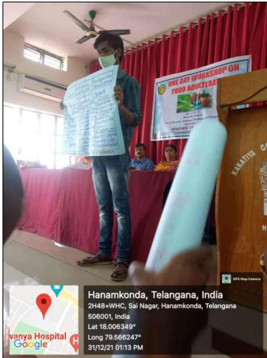
Student's poster Presentation on Health hazards caused by food Adulteration