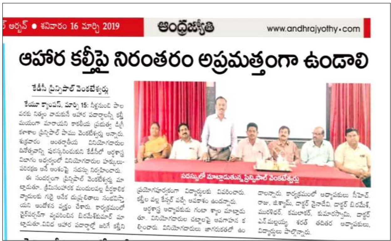
Print media Coverage on Consumer's Day celebrations.